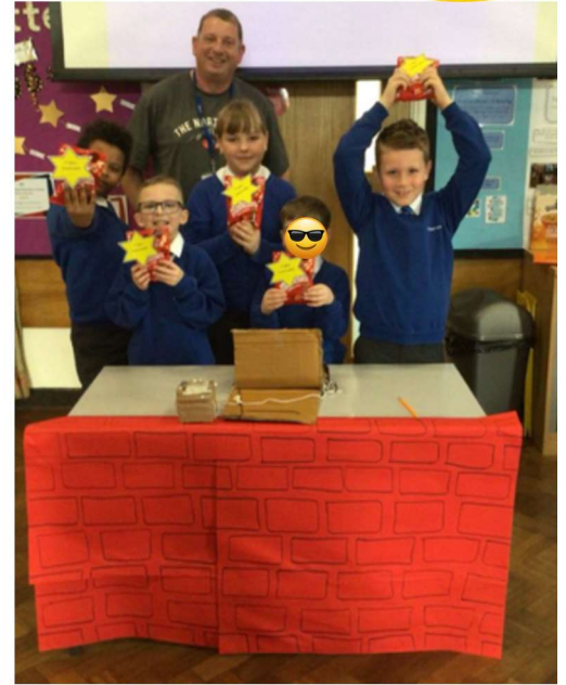
Our winners, Rigil, designed a counter-weight elevator type invention.