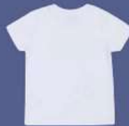
White t-shirt (no logos)