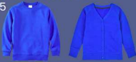
Royal blue round neck jumper / cardigan (logo - direct from school or Natasha's Schoolwear, Huddersfield / non logo - supermarkets)