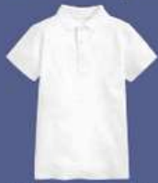
White polo shirt (available at supermarkets)