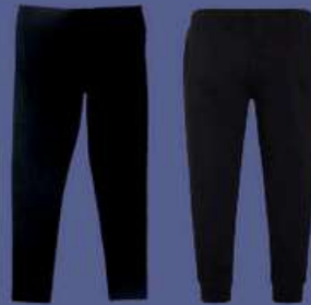
Black joggers or leggings - no tracksuits