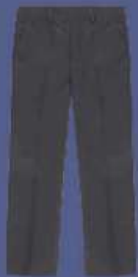
Grey trousers / skirt / pinafore (supermarkets)