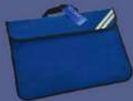
Blue book bag (Order from school)