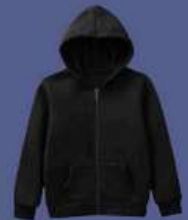
Black hoodie sports top (no logos)