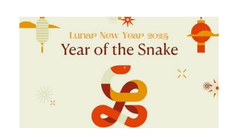
Year 6 made paper fan snakes to celebrate Lunar New Year.